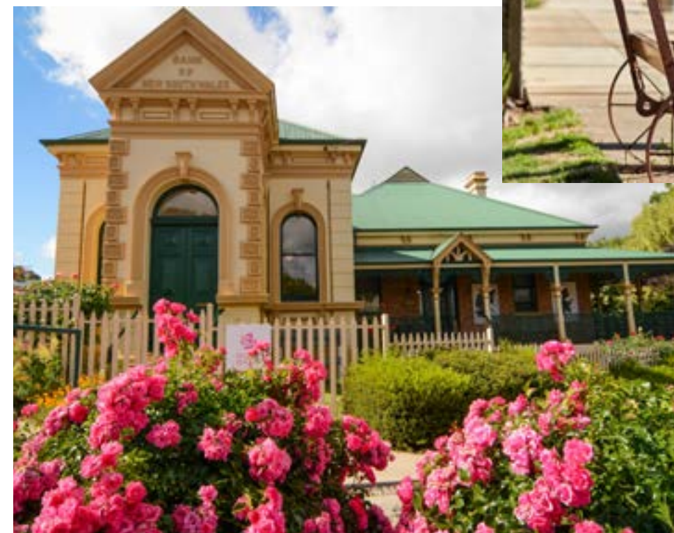
CLOCKWISE, FROM TOP Stock up on treats at the Old Mill Cafe and Bakery in Millthorpe; roam the pretty streets of the little heritage town; stay at Rosebank Guesthouse & Gallery, which dates back to 1902.