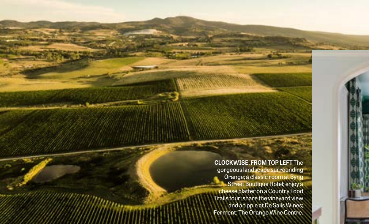
CLOCKWISE, FROM TOP LEFT The gorgeous landscape surrounding Orange; a classic room at Byng Street Boutique Hotel; enjoy a cheese platter on a Country Food Trails tour; share the vineyard view and a tippie at De Salis Wines; Ferment: The Orange Wine Centre.